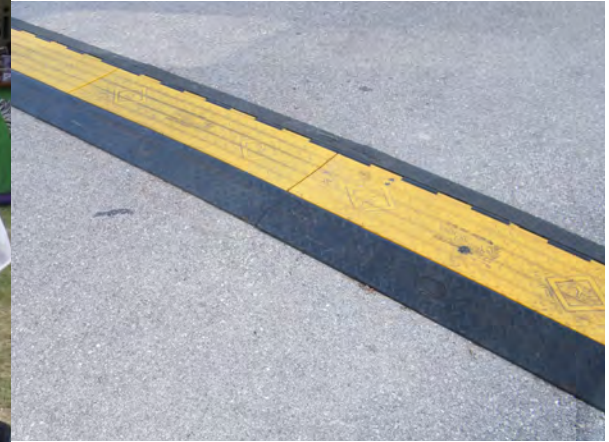
PICTURED: GD5X125 IN USE (LEFT) YJ5-125 USE (TOP)

Checkers™ Cable Management offers the most extensive line of high performance cable/hose protection products in the world. These durable cable protection systems provide a safer method of passage for pedestrian traffic, vehicles and heavy duty equipment while protecting valuable electrical cables, cords and hose lines from damage.